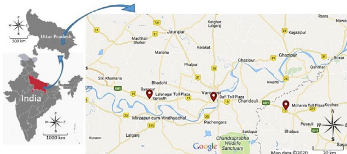
Fig. 1: Geographic location of the study area along with the selected road toll booths for data and sample collection

collected for 20 days during a period of 10 May 2017 to 14 July 2017; overall, the three stated road toll plazas and its mean was assessed over the permissible limits. Descriptive statistics were used for the analysis of PM_{2.5} and PM_{10} concentrations and noise levels at the three toll booths. Further, mathematical formulations were used for the assessment of fuel wastage at the selected toll booths. For assessment of fuel wastage and cost incurred due to waiting at toll plazas on Indian national highways, various observations were taken at each of the selected toll booths. The average waiting time in a queue for a vehicle and length of the queue were observed at all the three selected toll booths for different time clusters per day as of the survey of the peak and off-peak hours. The data for the total number of vehicles passing per day from a toll booth was retrieved from the website of Toll Information System-National Highways Authority of India (Toll Information system, 2017). Various assumptions were made over the observed data, so the results assessed are subject to the assumptions made.